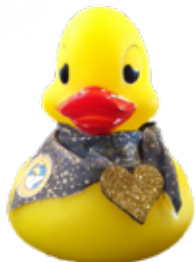
"Heart of Gold" Collectible Duck

(includes VIP check-in, parking validation, wine charm, 5 opportunity drawing tickets, T-shirt and swag bag)